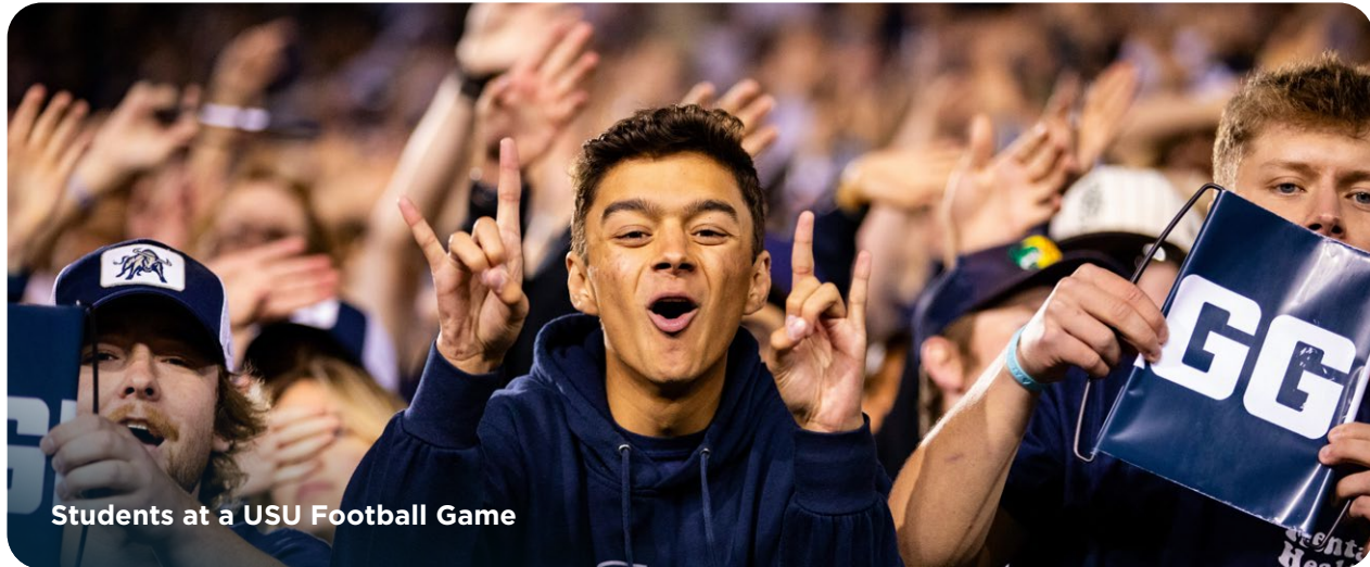
Students at a USU Football Game

Utah State University has successfully fulfilled its three-fold mission as the state's land-grant institution since its founding in 1888. USU provides access to higher education for Utahns, researches critical issues affecting the state, and provides Extension and outreach efforts to improve Utah communities and families through Extension and outreach. With over 28,000 students across three residential campuses, six non-residential campuses, and 23 statewide education centers, USU proudly – and accurately – calls itself “Utah’s state university.”